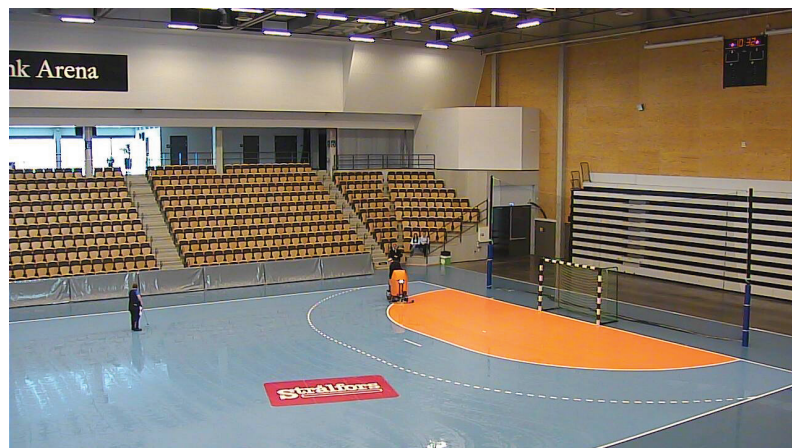
Fig. 7 Wide view with an HDTV 720p camera