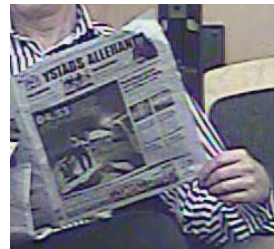
Fig. 1 Max. tele view with a 36x zoom, 4CIF camera Fig. 2 Cropped view of image at left