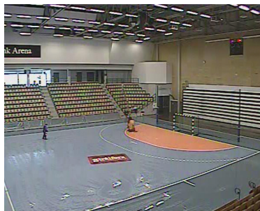
Fig. 5 Wide view with a 4CIF camera

Let's take a look at how the cameras perform in wide mode; that is, using their smallest focal lengths (with no zoom)? Compare the pictures below.