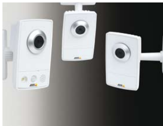
The small and smart AXIS M10 Series is a perfect complement to AVHS. Other network cameras from our wide range can also be used.