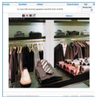
The user interface can be customized to meet your company's profile.