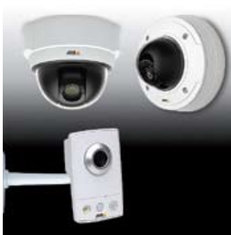
Most Axis network video products are suitable for AVHS system setup.

An Internet-based video monitoring system offers an easy and effective way to manage your customers' security concerns while at work, at home or on the road. The users can connect to your service portal and watch live or recorded video using a computer as well as most modern cell phones.