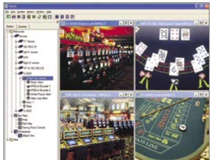
VIDOS PC interface and IntuiKey operator

Finally, the operator can choose between a PC keyboard and mouse or Bosch's IntuiKey CCTV keyboard – a simple yet effective and very robust interface.