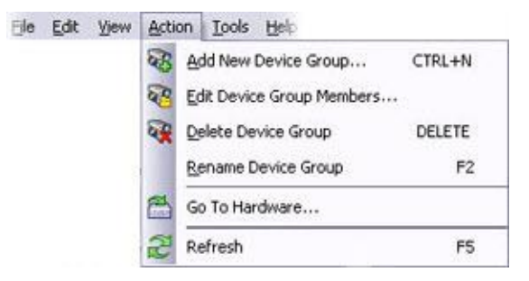
Example only - some menus change depending on context.